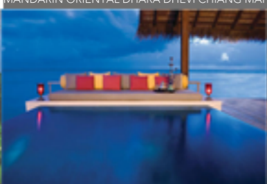
MOST LUXURIOUS FLOATING VILLA ONE&ONLY REETHI RAH