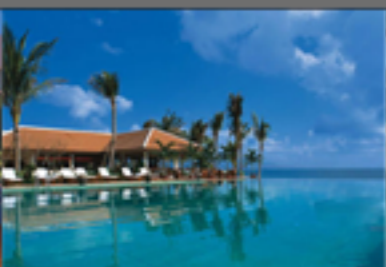
MOST UNIQUE MASSAGE EVASON ANA MANDARA RESORT & SIX SENSES