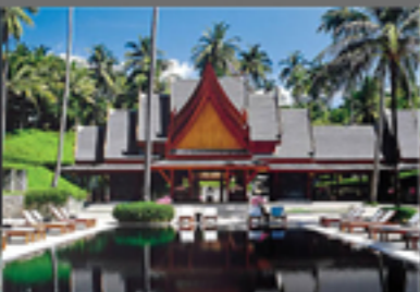
BEST ON-SITE TAILOR AMANPURI