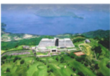
BEST HILLTOP RESORT THE WINDSOR TOYA RESORT AND SPA