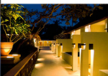
BEST PLACE TO MASTER THE ART OF BALINESE COOKING