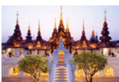
BEST PLACE TO EXPERIENCE NORTHERN THAI CULTURE MANDARIN ORIENTAL DHARA DHEVI CHIANG MAI