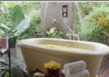
PRETTIEST PLUNGE POOL FOUR SEASONS RESORT AT SAYAN