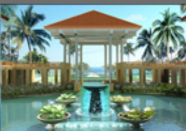
ONLY PRIVATE POOL VILLA RESORT IN CHINA BANYAN TREE SANYA RESORT AND SPA