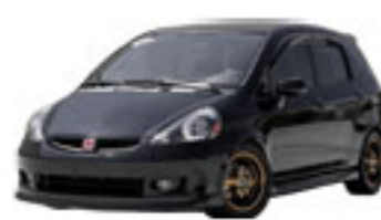
2007 Honda Fit 1.5L